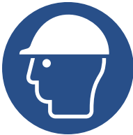
M014 Wear head protection