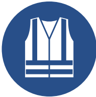
M015 Wear high-visibility clothing