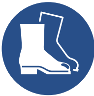
M008 Wear safety footwear