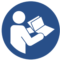
M002 Refer to instructions manual

This operations manual describes general inspections, servicing and operation with the normal safety precautions required for normal servicing and operating conditions. It is not a guide, however, for abnormal conditions or situations, and therefore service personnel and operators must be safety conscious and alert to recognise potential servicing or operating safety hazards at all times, and take necessary precautions to assure safe servicing and operation of the equipment.