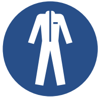
M010 Wear protective clothing