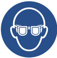
M004 Wear eye protection