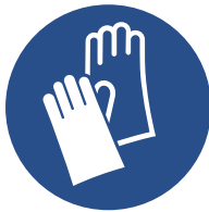
M009 Wear protective gloves